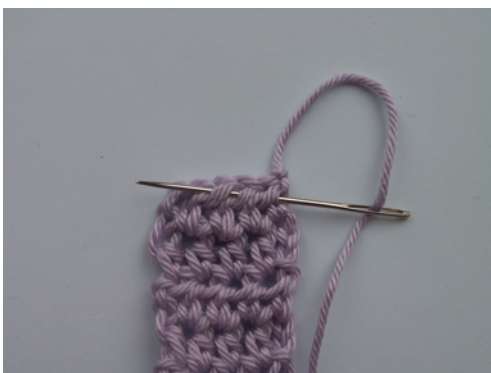
Sewing in ends

Simply cut the yarn, leaving 15cm tail. Pull the tail through the loop on the hook and pull tight.