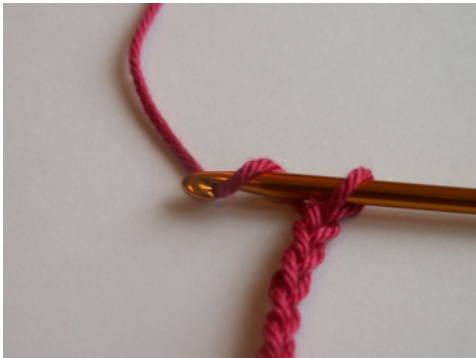
Chain Stitch (ch)

When counting ignore slip knot and loop on hook. bring yarn over hook, back to front. Pull yarn through loop on hook.