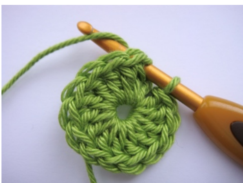
Slip Stitch (sl st)

Use a blunt ended tapestry needle. Weave the needle in and out of the back of the stitches. Trim end.